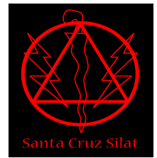
Santa Cruz Silat www.santacruzsilat.com