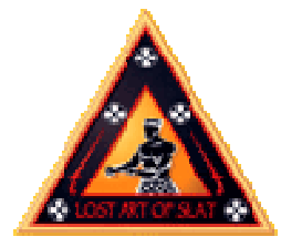
L.A. Silat